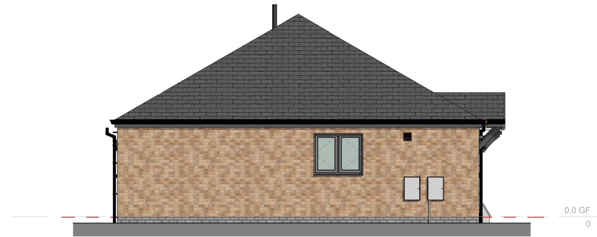
3 1601 - Gable Elevation (Kitchen Gable) 1 : 50

Sheet: S4, Revision: P01, Date: 14/05/23, Drawn By: MK, Checked By: LJ First issue for initial design team comments. Note: further design development yet to take place.